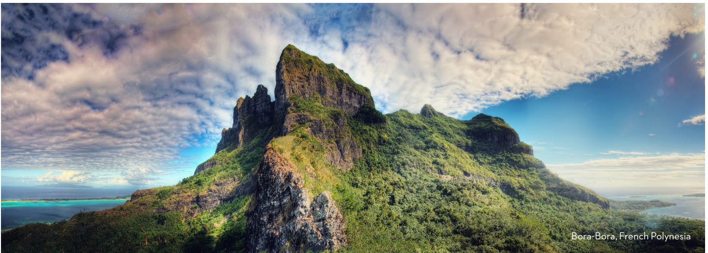
Bora-Bora, French Polynesia