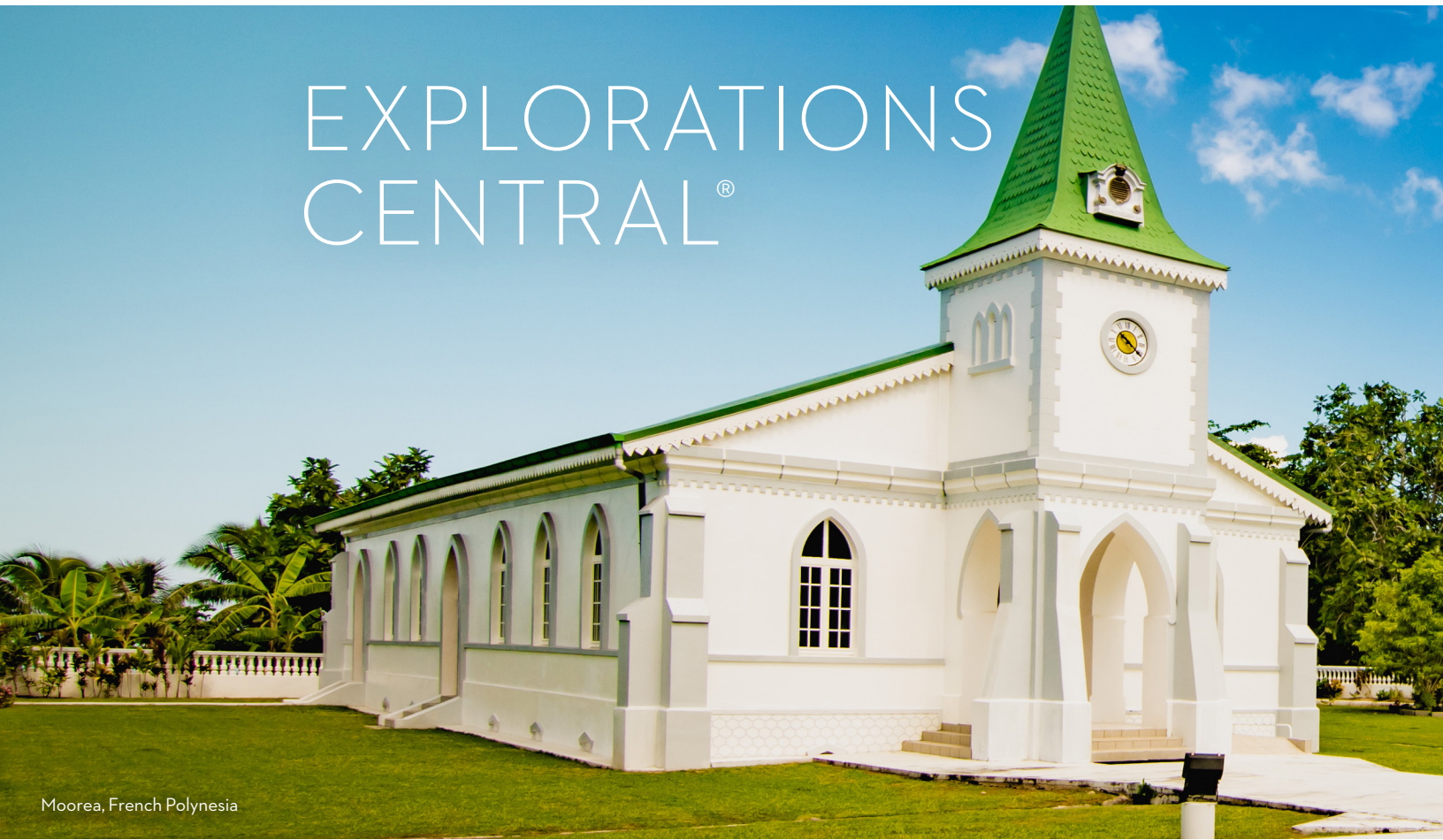
Moorea, French Polynesia