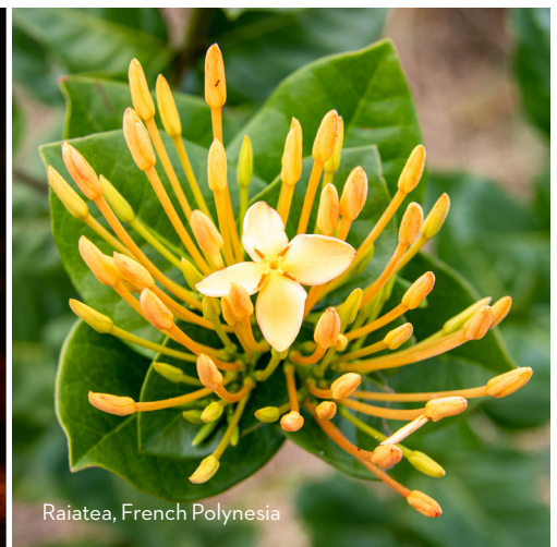
Raiatea, French Polynesia