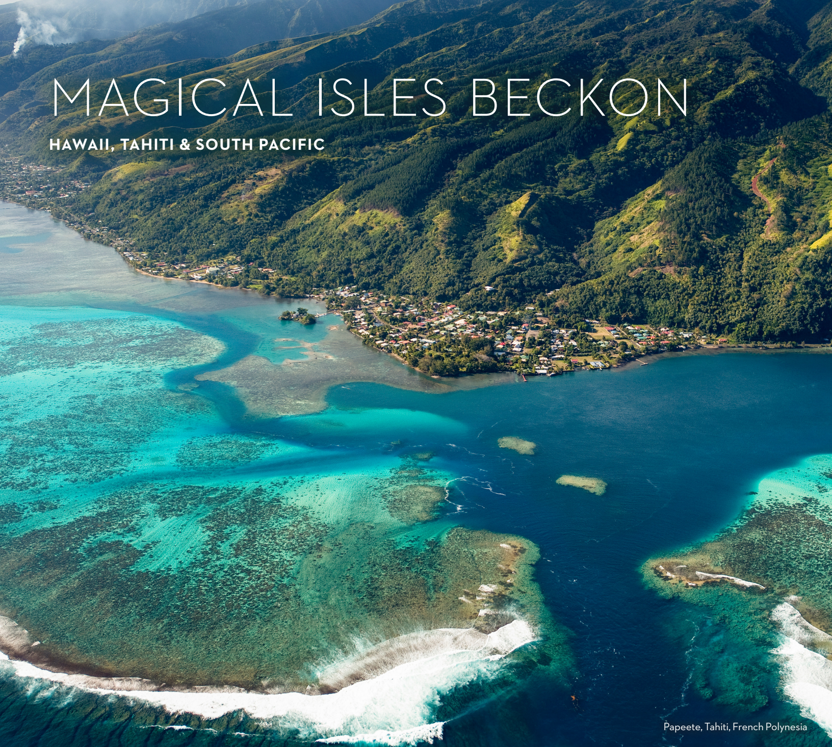
Papeete, Tahiti, French Polynesia